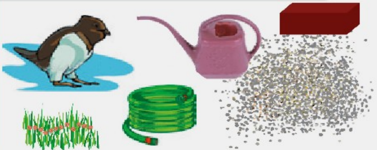
With his beak, the bird could peck one hole by one to the watering can and the water rises.

You decide A bird flew all day and is very tired. Night is falling and it's time to stop. The bird is very thirsty. But all it can see is a watering can with a tiny amount of water at the bottom. It will never reach the water! How can the bird use what is in the picture to get a drink of the water?